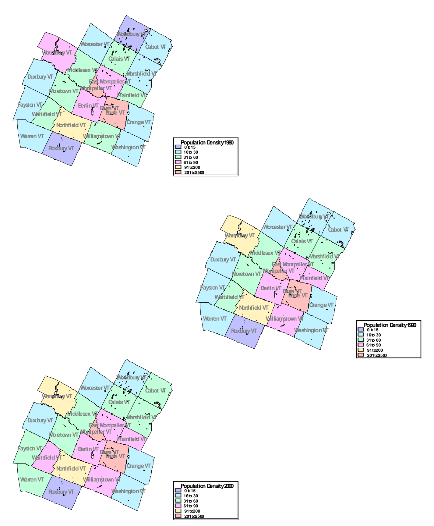
Figure 2. Central Vermont Region Population Density—1980, 1990, 2000